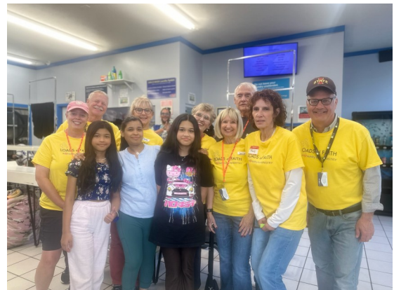
Aug. 27 Laundry Time in North Hill