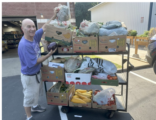
OPEN M receiving our garden produce.