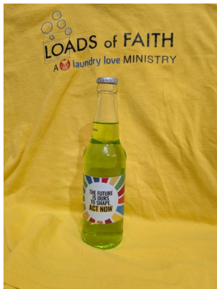
Special soda for the event.