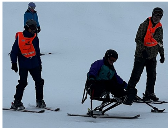
Guiding a mobility impaired person

For more than 50 years, 3 Trackers of Ohio has been dedicated to the promotion of adaptive recreational sports to persons of all ages with a variety of physical disabilities. Three Trackers of Ohio is a 501(c)3 tax exempt non-profit organization. For information about the organization or about volunteering, visit the website: http://www.3trackers.org .