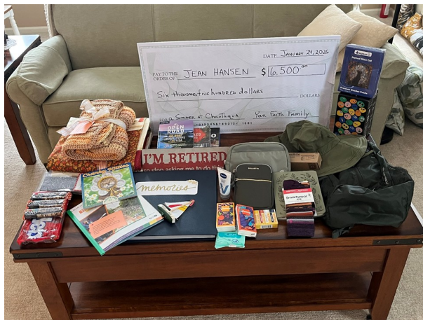
Pastor's "24 Group Gifts"

Backpack/Daypack Passport Pouch Hat Hiking Socks 50 Hikes Ohio book The Open Road book Hiking Journal Fanny Pack Wet Ones Kleenex Chapstick Hand Lotion Twizzlers