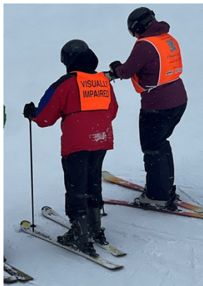
Assisting a blind person

This group of volunteers is dedicated to helping people with disabilities access and participate in various summer and winter outdoor activities. About twenty of these generous volunteers were seen at Brandywine Ski Resort on Sunday, January 11.