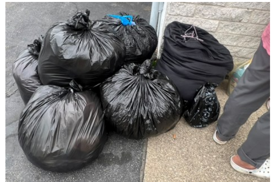
Examples of how people bring laundry to our LoF service.