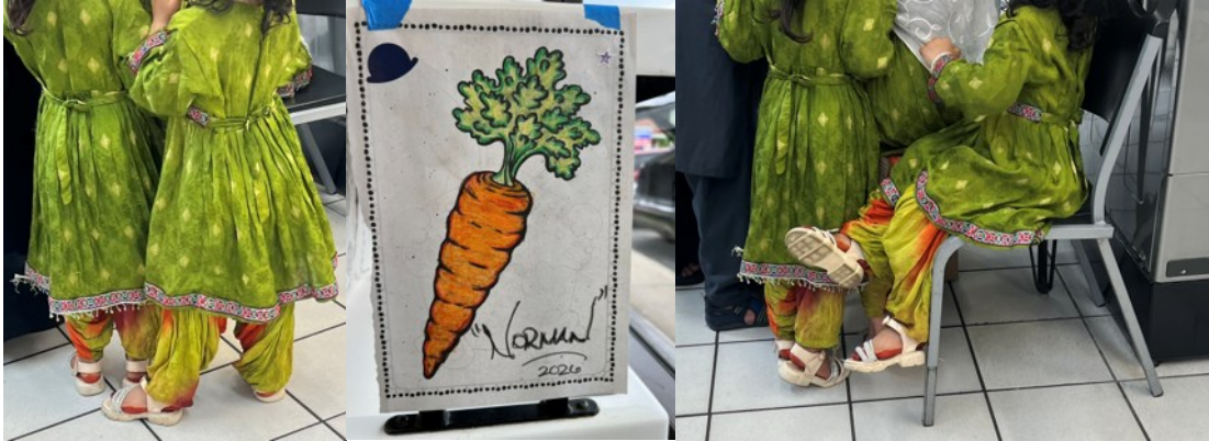
Children keep themselves busy coloring while their parents tend to the laundry at Laundry Time in North Hill, during Faith's Laundry Ministry.