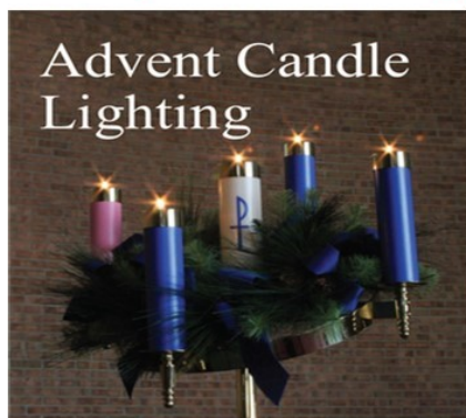
Advent Candle Lighting